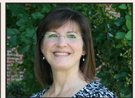
Mrs. Laura Wilson French (US)